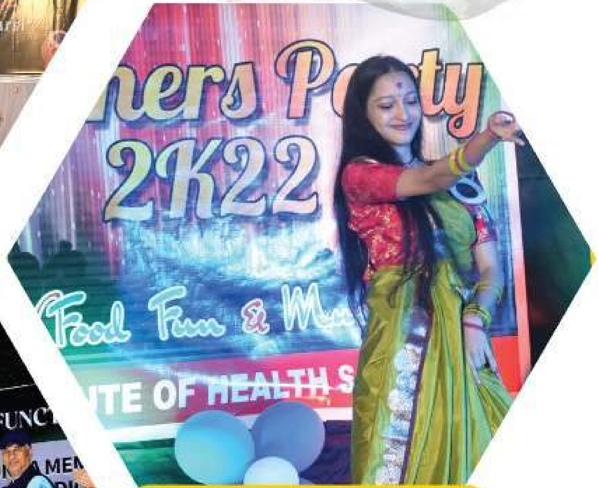
FRESHERS PARTY WELCOME DAY