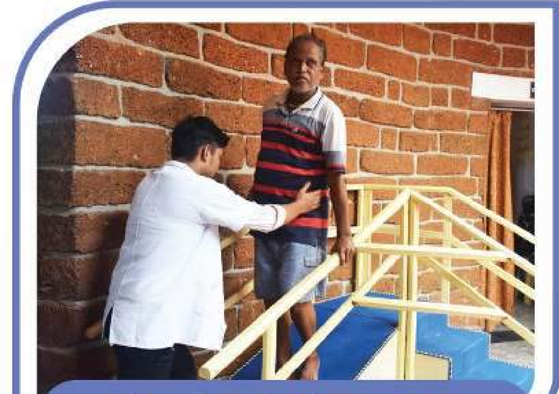
Physical Disorders Clinic