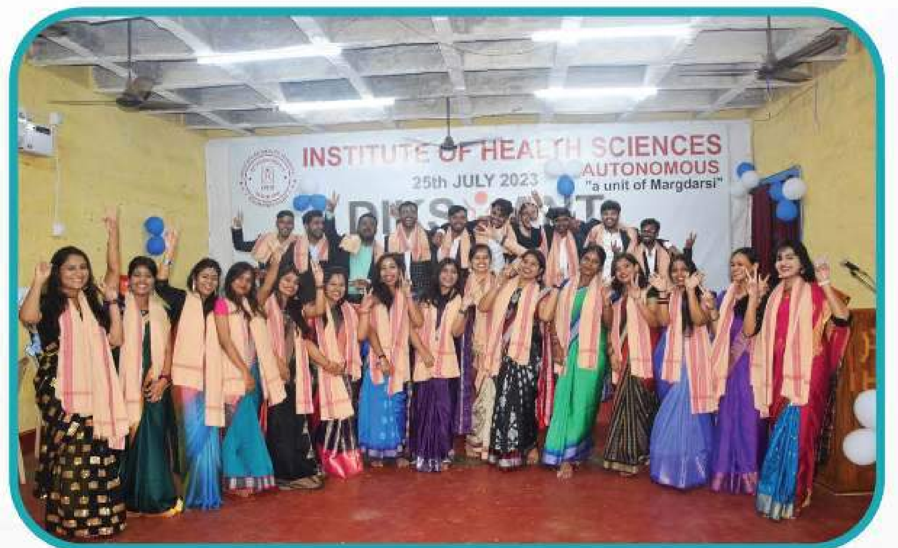
A dignified farewell to the qualified students at Dikshant Samaroh, 2023