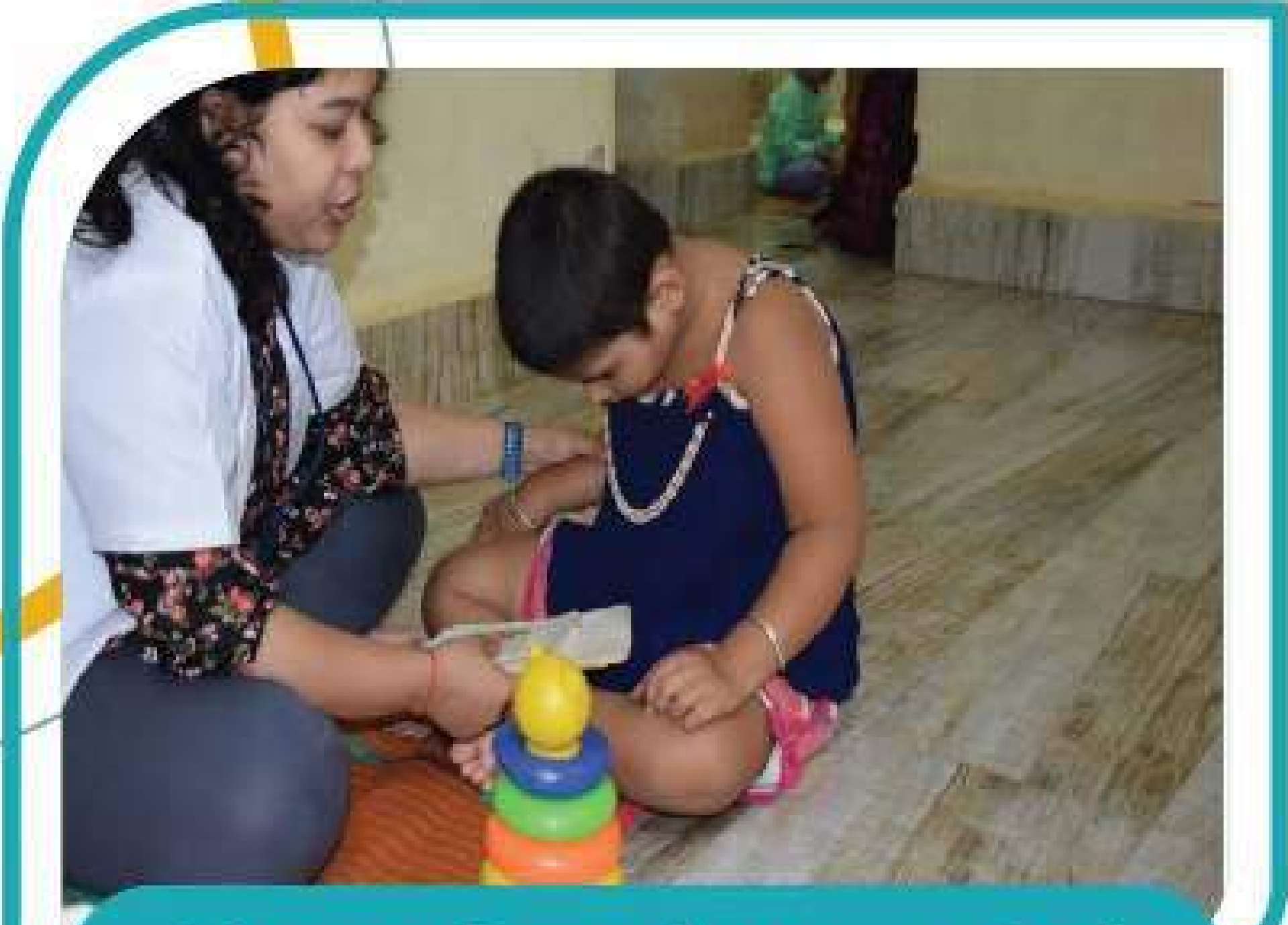
Neuro Developmental Clinic