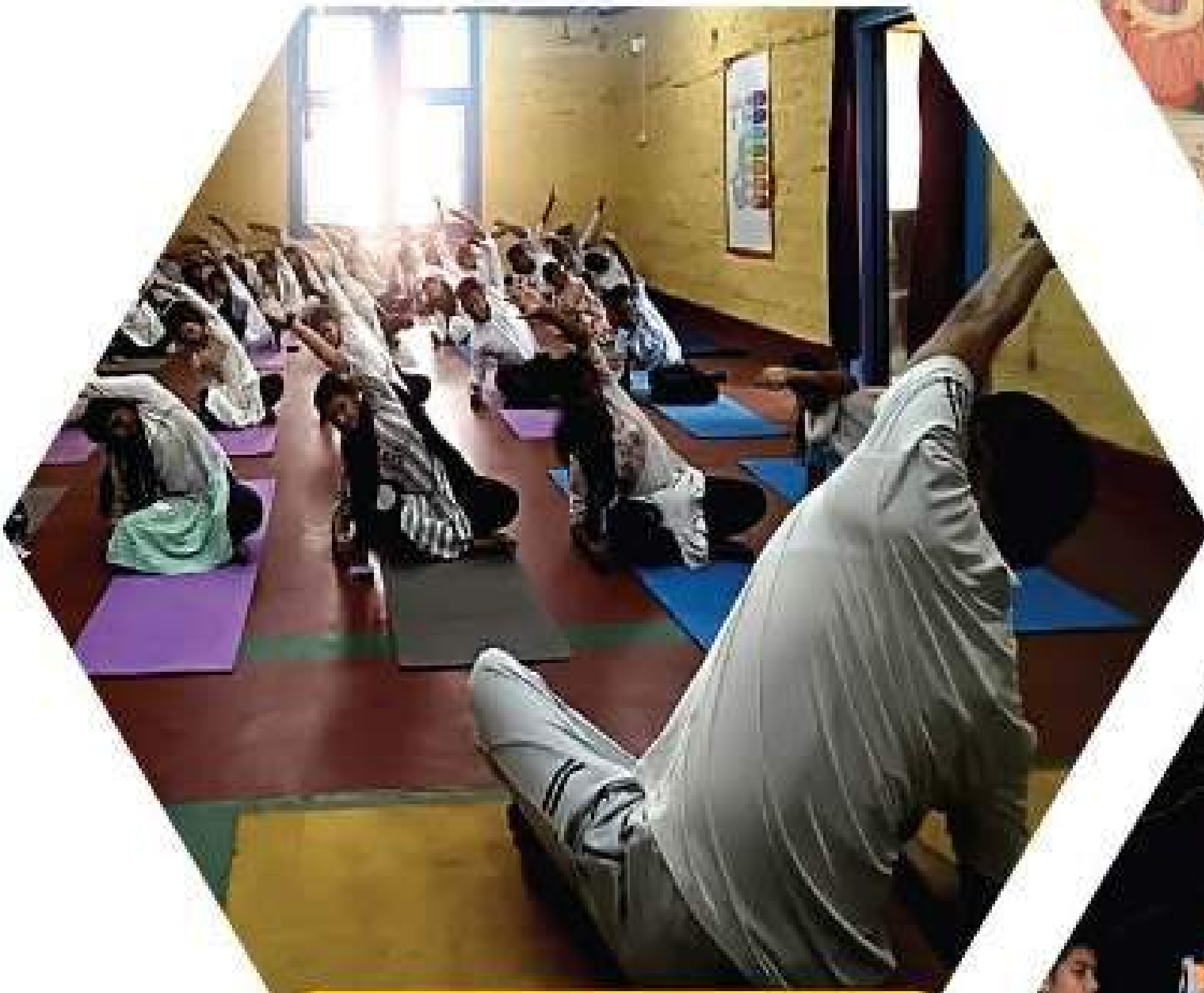
INTERNATIONAL YOGA DAY