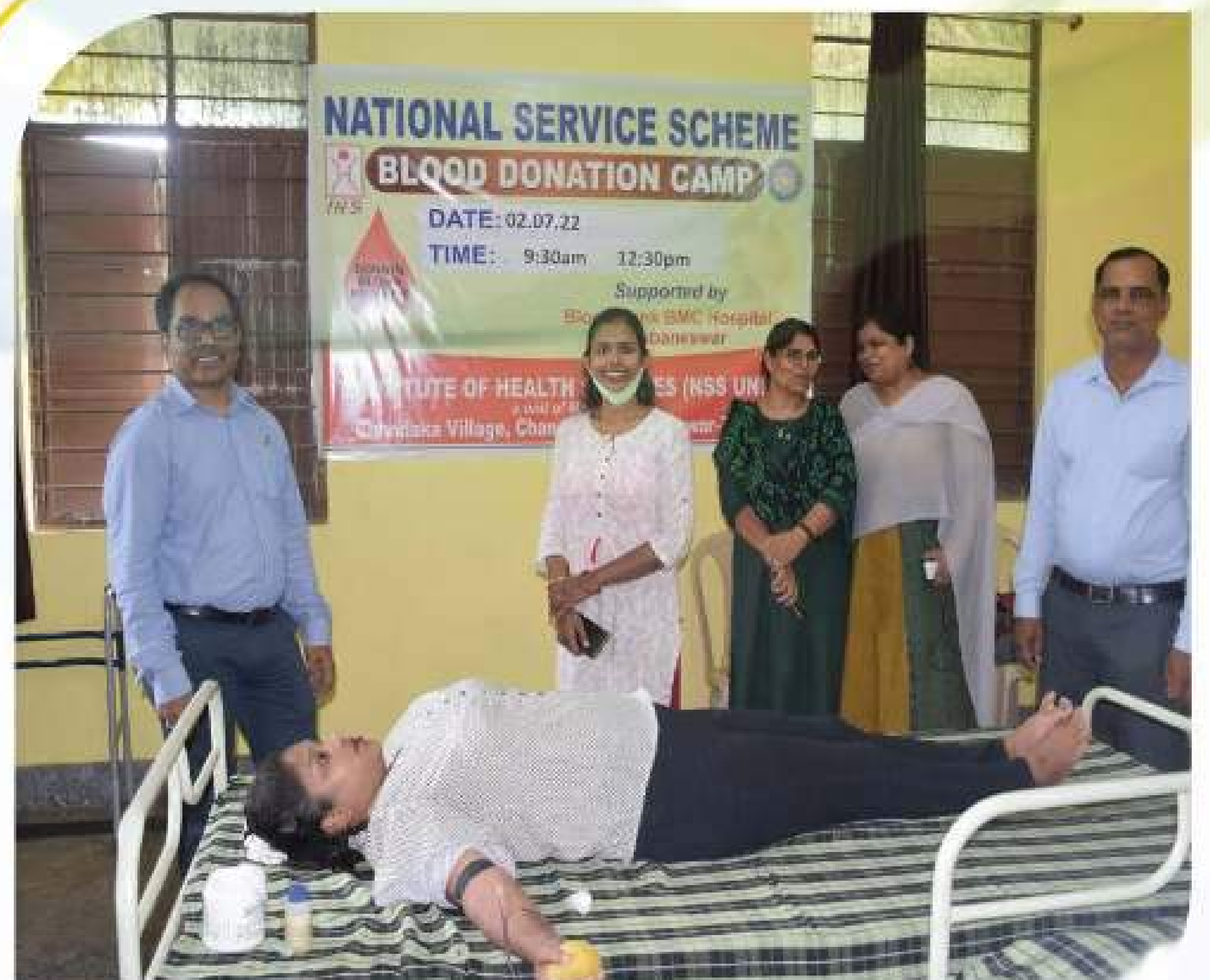
Blood donation is done by students and staff of I.H.S under NSS scheme with support of Hospital's Blood bank

Ongoing project with support from SSEPD dept Govt. of Odisha