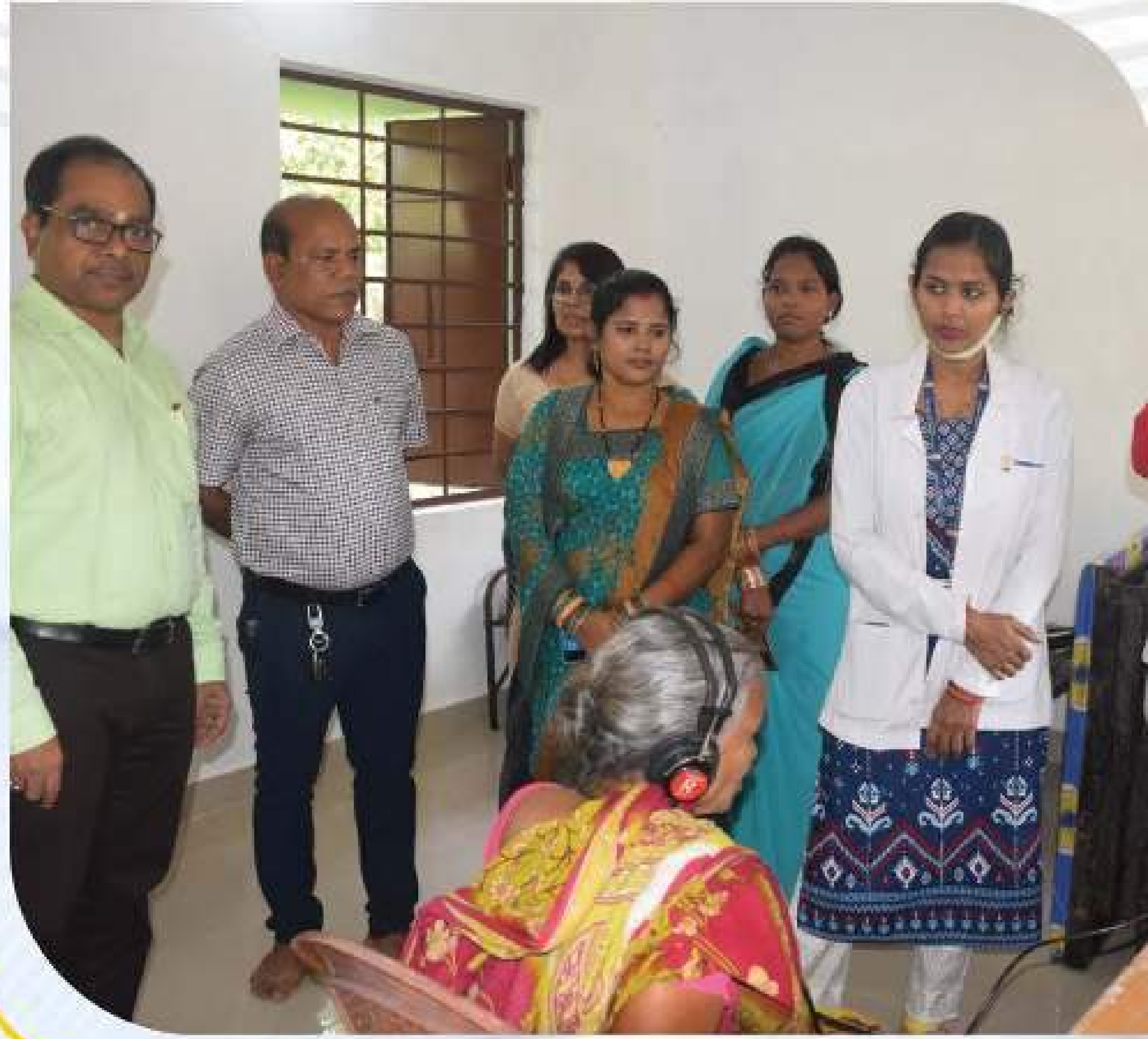
Hearing Screening of villagers by professional Audiologists at their doorstep