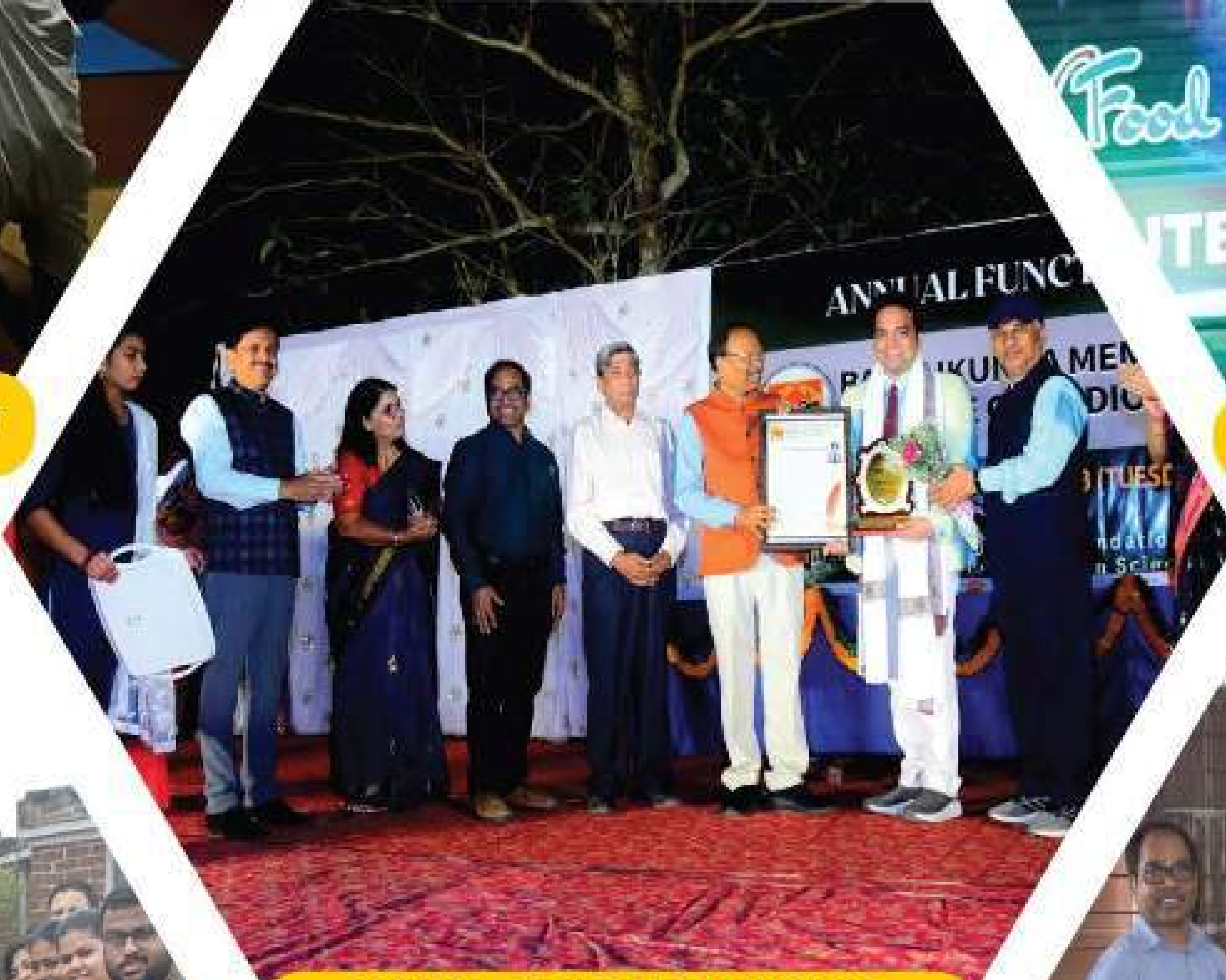
ANNUAL DAY OF BALMUKUND MEMORIAL CENTRE OF AUDIOLOGY