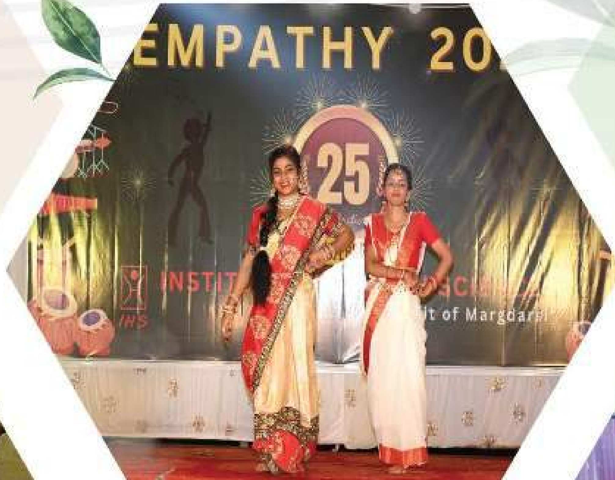
FOUNDATION DAY CELEBRATION