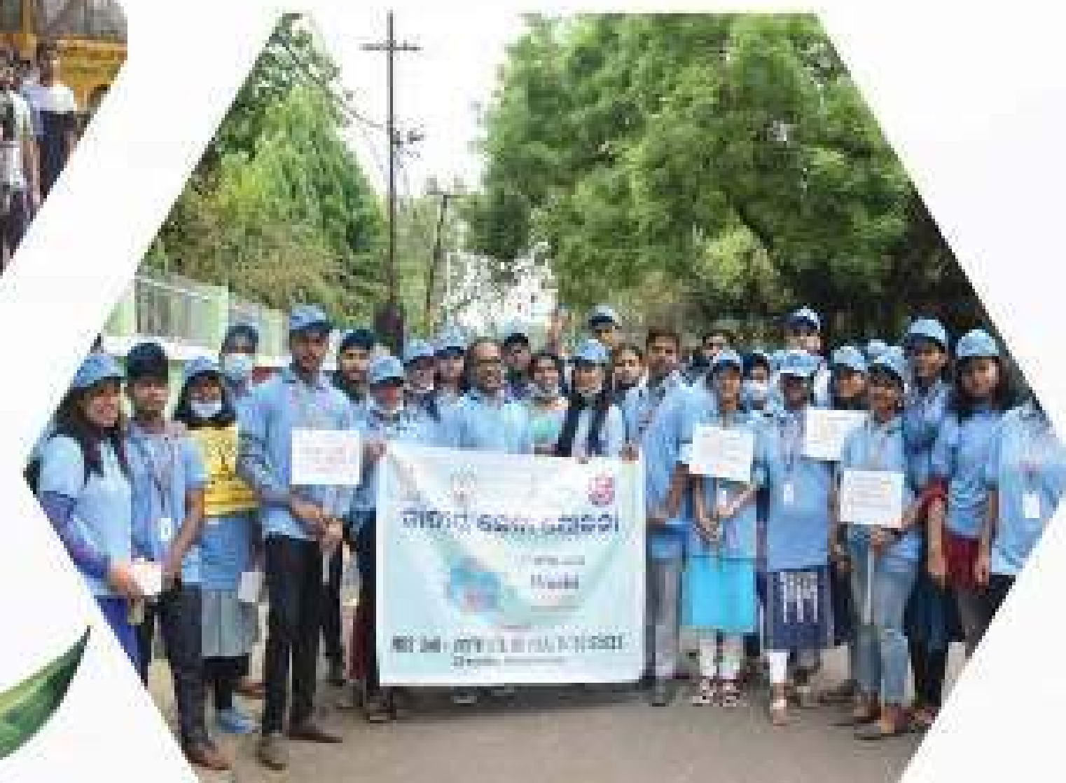
AUTISM AWARENESS DAY