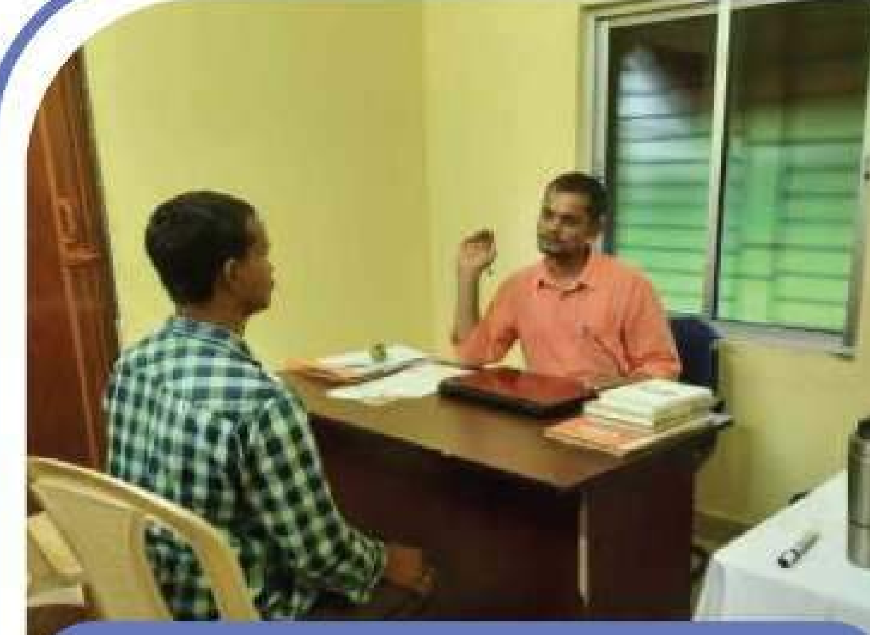
Brain Fitness Clinic