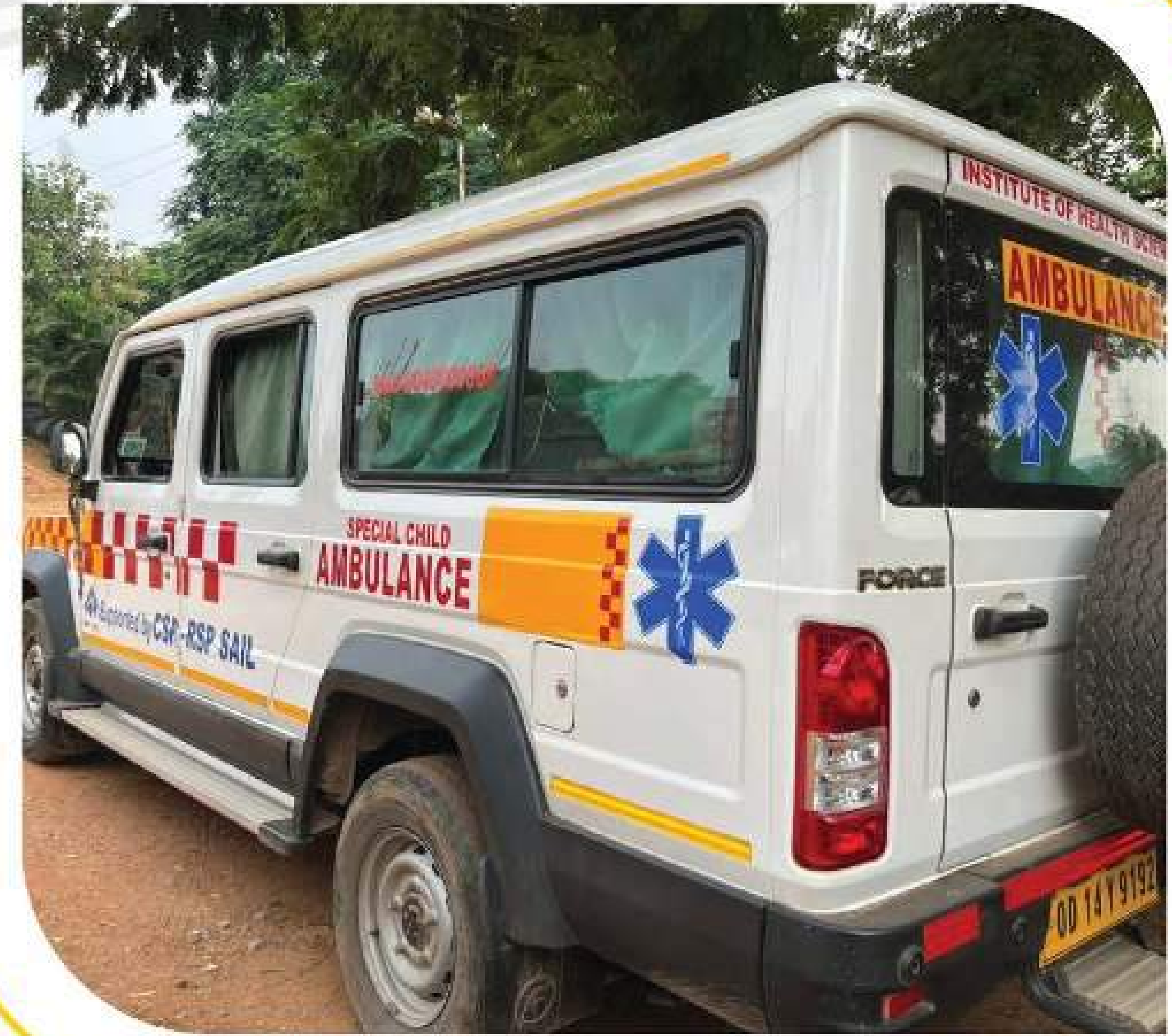
CSR support from RSP sail, Roulkela has made it possible to provide conveyance facility to children with special needs