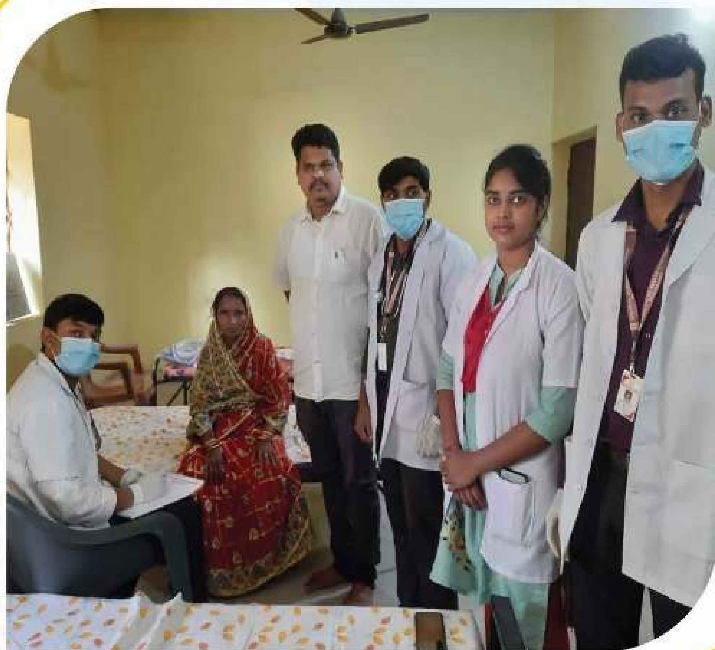
Outreach services to identify disabling condition of neurological and musculo skeletal disorder.