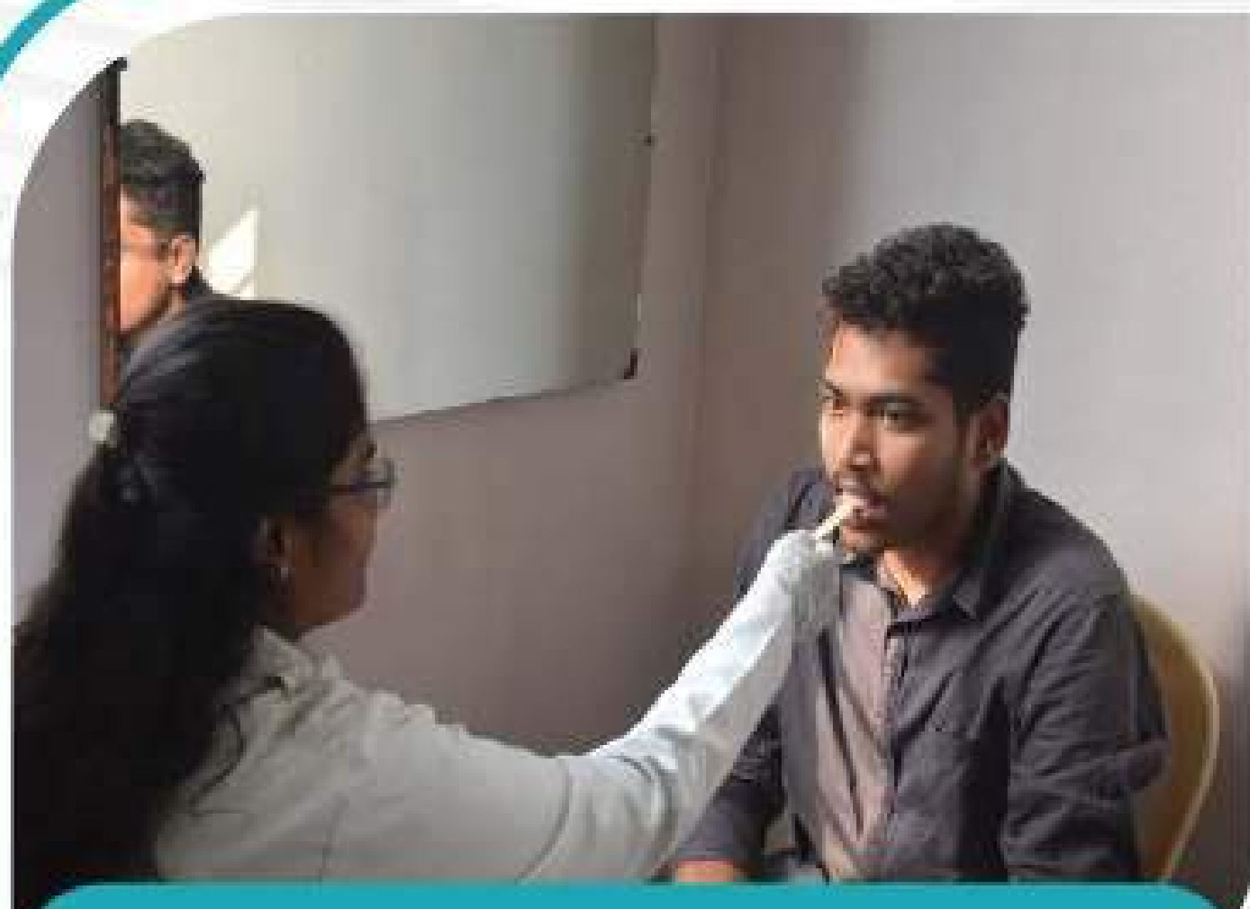
Speech Language Clinic