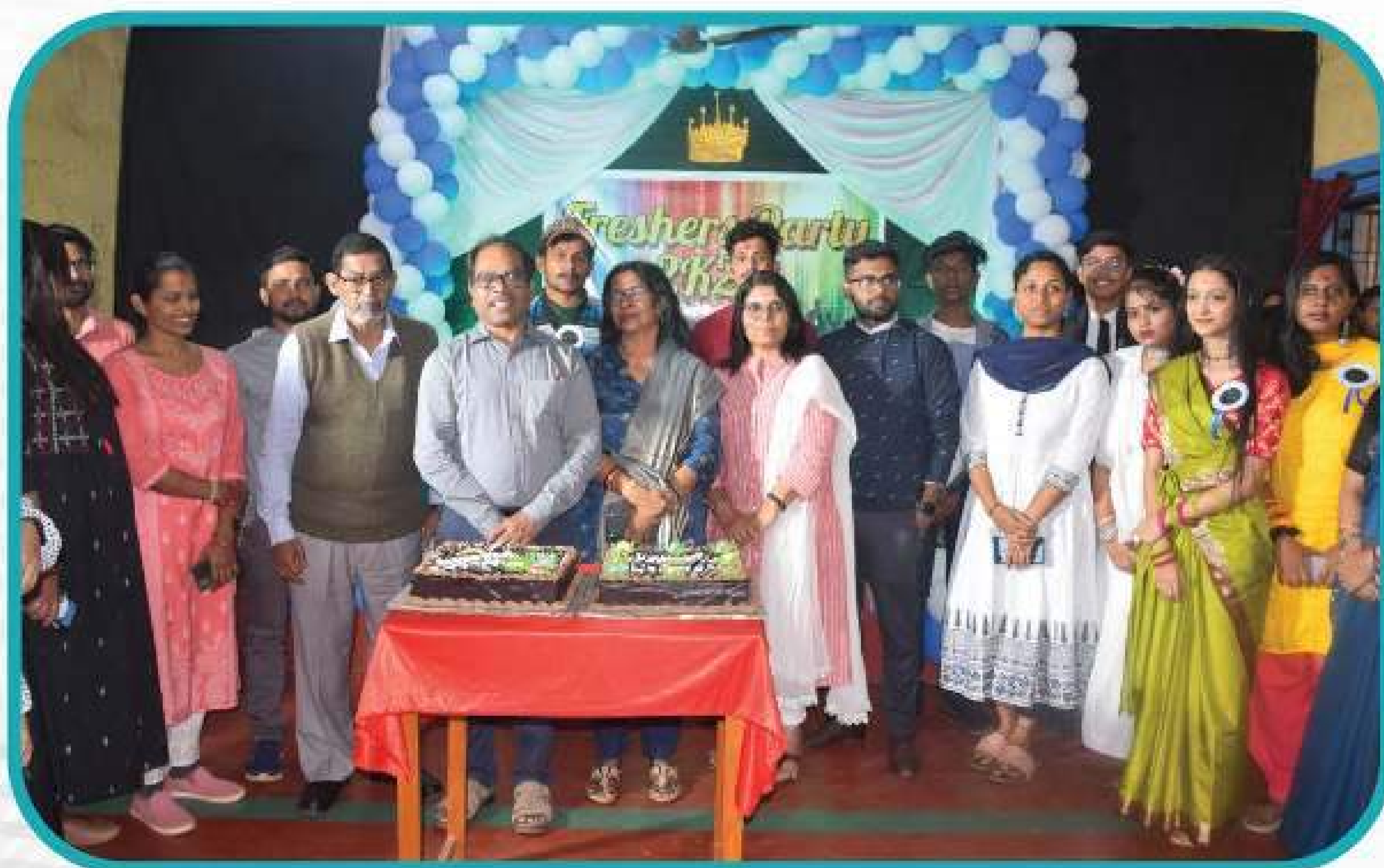
Warm welcoming to the freshers to a new world of mission for medical rehabilitation